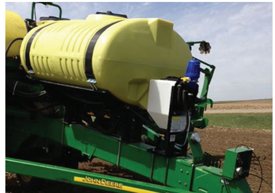
Typical mounting of 19-gallon INDEX holding tank and Dosatron system on planter.